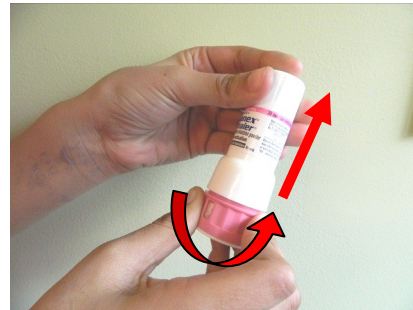
2. Hold top. Twist bottom to remove cap.