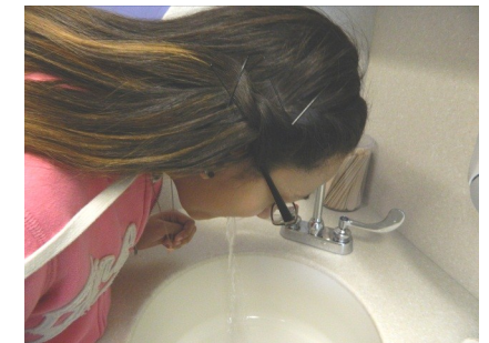
8. Spit out water.