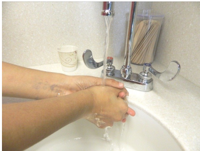
1. Wash hands.