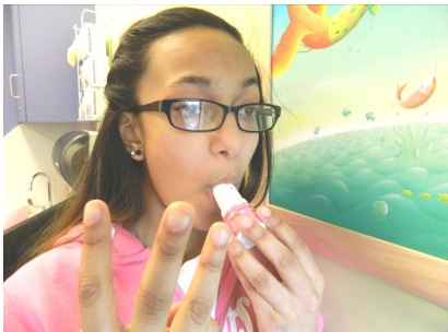
5. Try to hold breath for 10 seconds. Use your fingers to count the seconds!