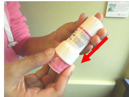
6. Put cap back on inhaler.